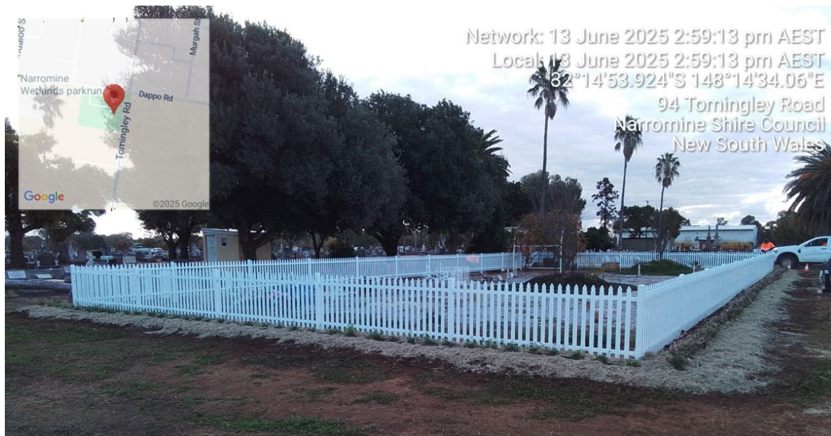
Figure 4: Plants have been planted at the Baby Grave area in the Narromine Cemetery