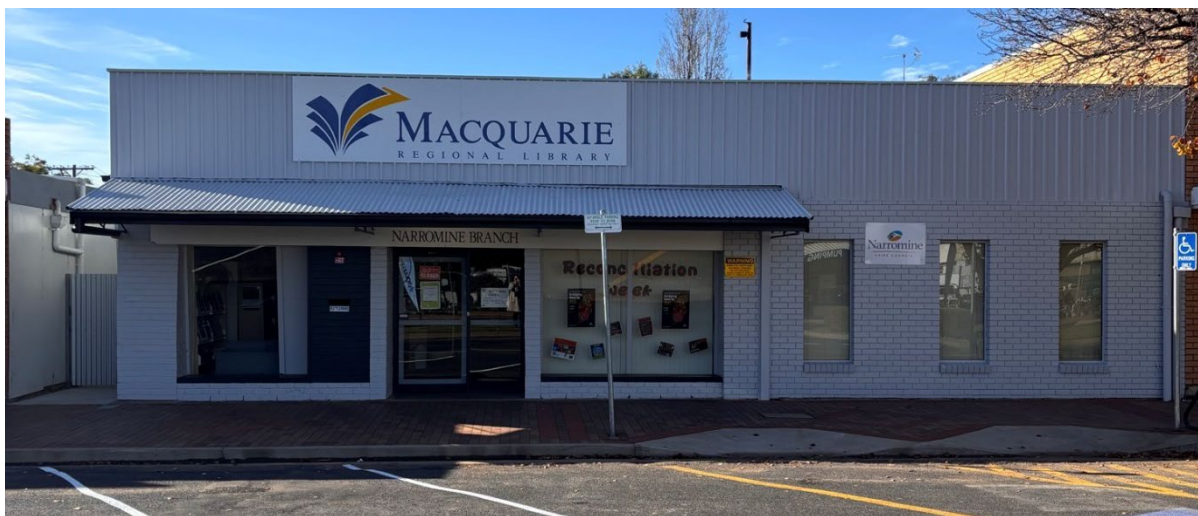
Figure 7: Freshly painted Narromine Library

At the Trangie Library, construction works are progressing. Earthworks have commenced, with excavation for the footings and piers currently underway. The concrete piers are expected to be poured in late June, marking an important milestone in the delivery of this project.