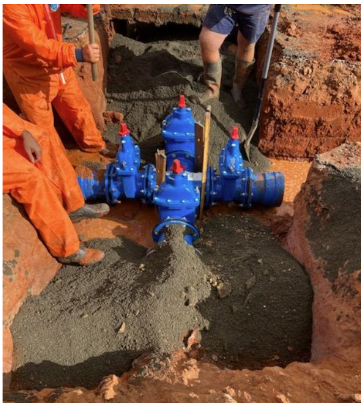
Figure 1: A new four way valve set installed as part of the main replacement works in Trangie

The water and sewer team have been busy over the last month. The trunk main from the reservoir along Harris Street in Trangie has now been successfully replaced. This significant infrastructure project aims to enhance water distribution and ensure ongoing reliable service to the residents. The two scheduled town-wide water outages to connect the new main have taken place, and the project went smoothly with minimal disruption. The new pipeline will ensure service continuity and a secure water supply for Trangie well into the future.