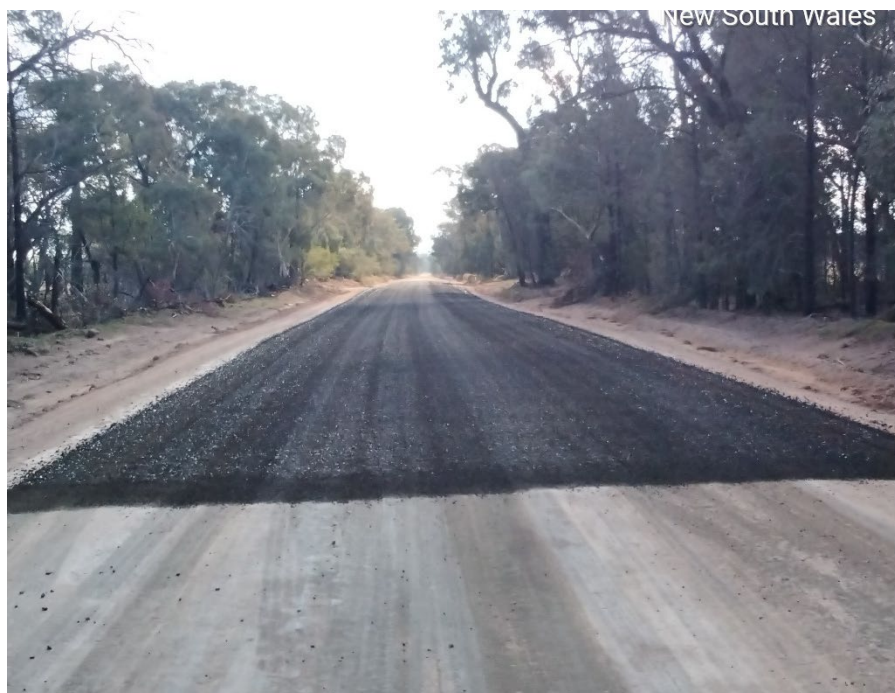
Figure 3: Upgrade works to Momo Road

Significant upgrade works on Momo Road were also completed during the review period.