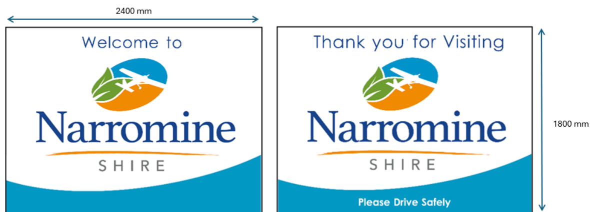
Figure 10: New signage to be installed on main entrance roads into the Shire

However, before signs can be installed on roads owned by Transport for NSW – including the Mitchell Highway – a Development Application (DA) must be approved by Transport for NSW. Council is actively working through this approval process and aims to complete installation of the new signage in the coming months.