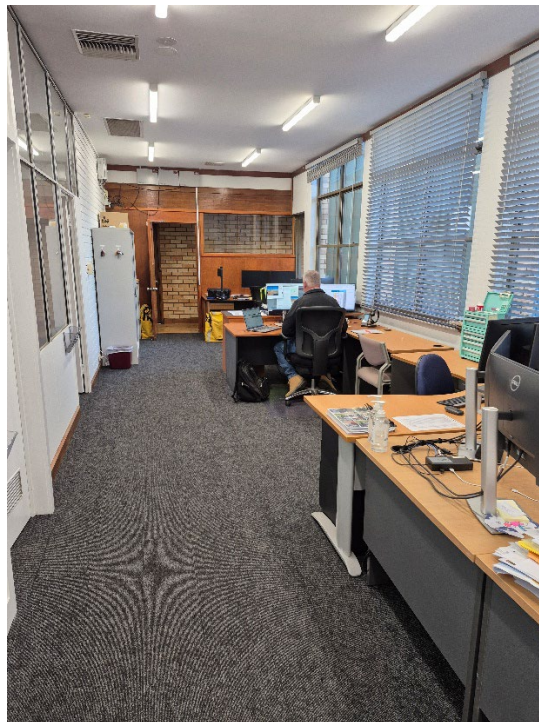
Figure 6: Updated engineering open-plan office space

The Council Chamber Roof Replacement Project is now complete. As part of the project, the roof has been replaced, and new carpet and internal painting have been completed within the offices. All office spaces are now fully operational.