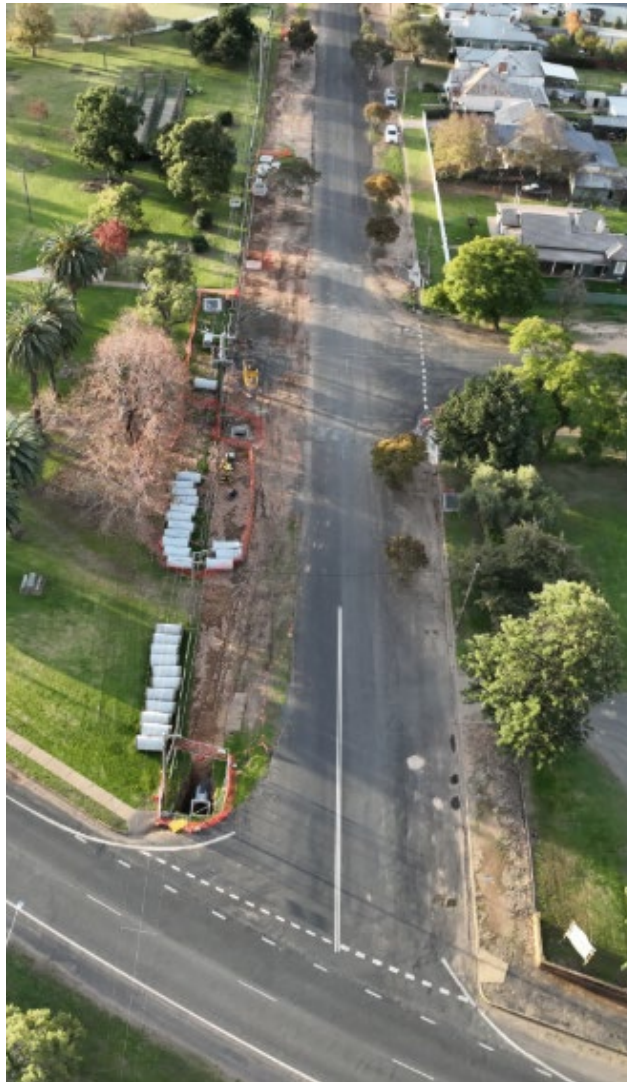
Figure 8: Northern Drainage Project - construction site

In addition to the capital works project, Council engaged a contractor to clean major stormwater mains within Narromine, with works undertaken in late May. This resulted in a thorough clean of the stormwater pipe network on the southern side of the railway line at Manildra Street.