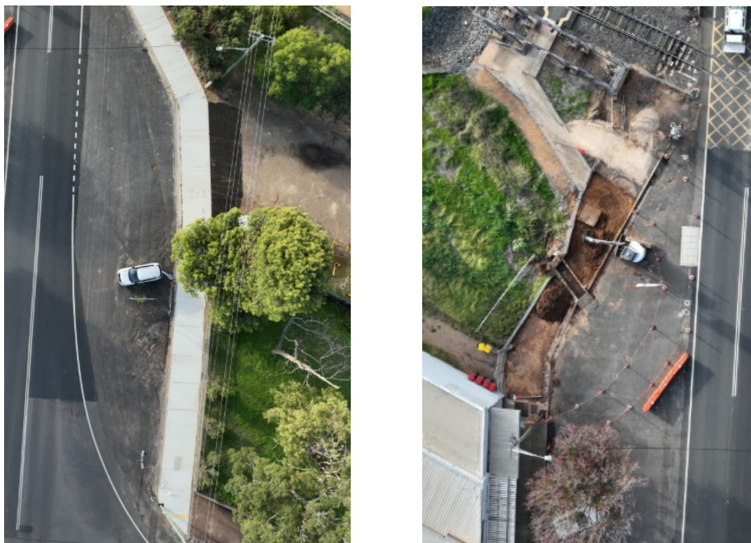
Figure 9: Dandaloo Street Footpath: (Left) completed eastern side; (Right) western side under construction.

The new footpath will continue through to the northern edge of the access laneway to Coles, connecting with the existing pavers.