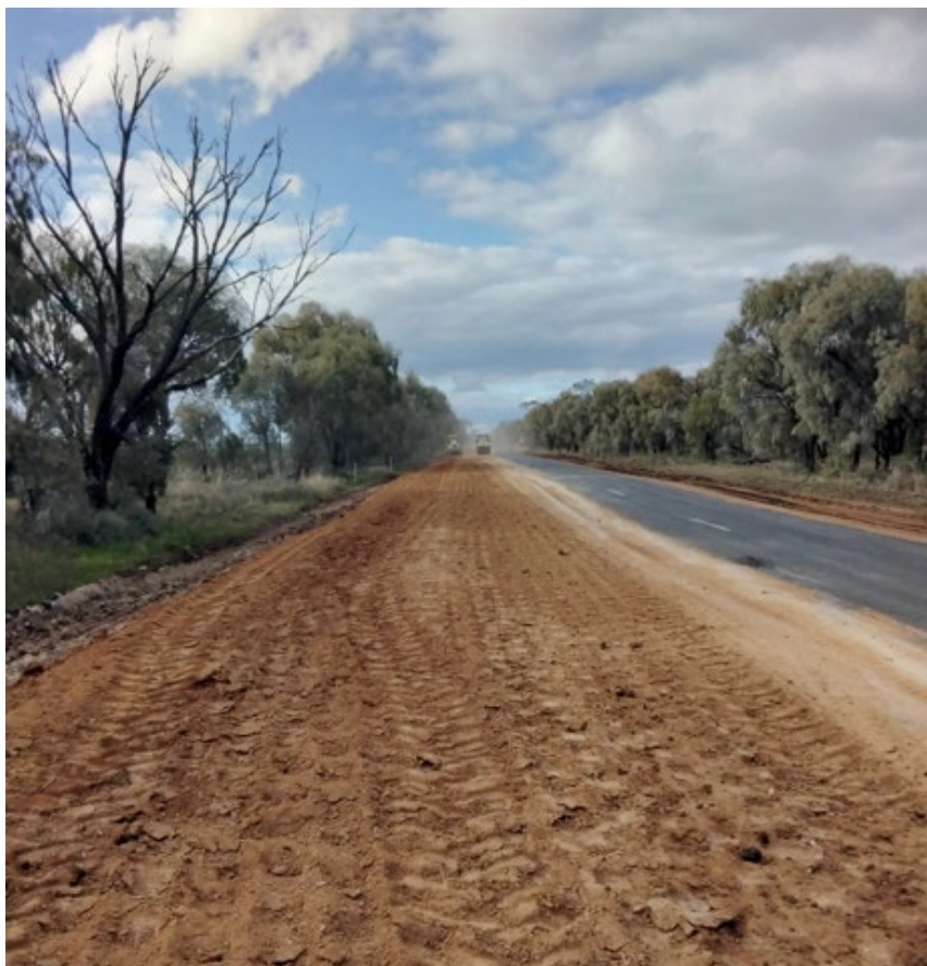
Figure 2: Shoulder widening on The McGrane Way

Significant upgrade works on Momo Road were also completed during the review period.